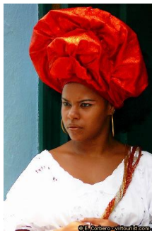
Africans in the Americas

Salvador, Bahia is vigorous City of around 2,600,000 inhabitants, stretched along the green tropical hills and the bucolic beaches along the Bahia de Todos os Santos (Bahia of All Saints).